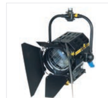
Fresnel lense spotlight