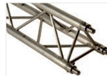
32916 3-Point truss

For halls A3–A6, B3–B6, C3–C4: True Logik GmbH Tel. +49 89 9077998-67 Fax +49 89 9077998-62 info@truelogik.com www.truelogik.com