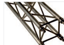
32917 4-Point truss