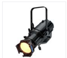
Profile spotlight, incandes- cent light, CDM-T, LED