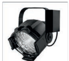
Daylight spotlight 150 W - 575 W